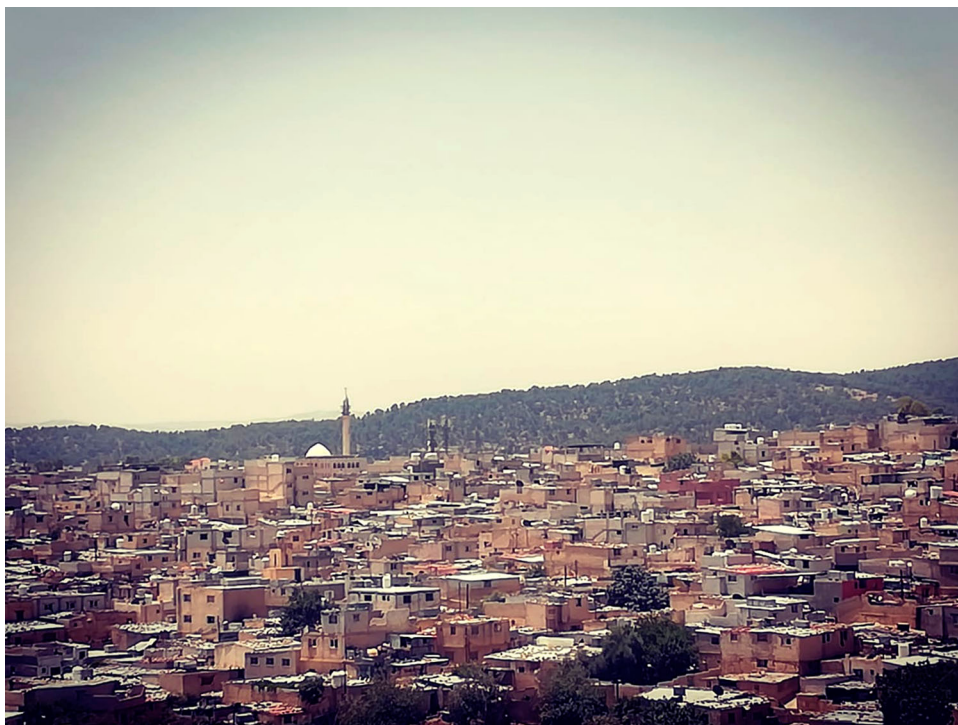
Figure 1. Al-Husun Palestinian Refugee camp in Jordan

reproductive health research. 31 Very little research has addressed menarche and menstrual health among adolescent girls in the West Bank and Jordan. 32–34